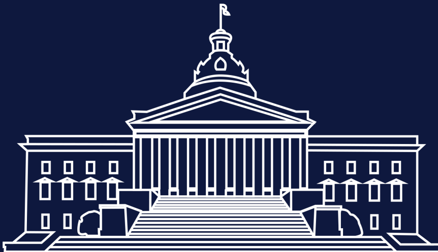
SC Statehouse Logo